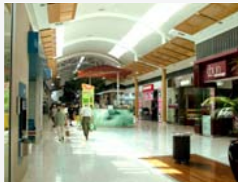
From top left: Exterior of Westfield Tuggerah, and interior showing David Jones store.