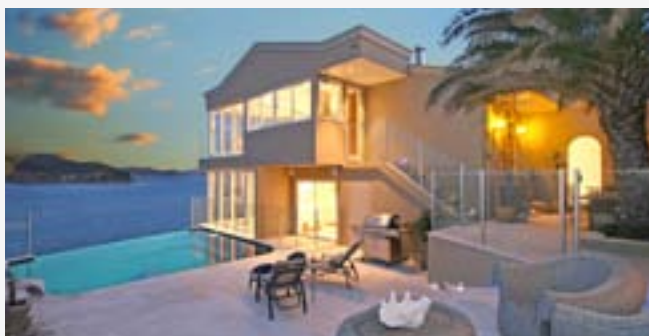
A home in Pearl Beach recently sold for $4 million dollars.

The best part is that you can choose to be close or as far away as you want from the shops, beaches, freeway or bush and stay within your budget.